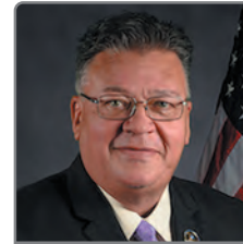
Iberia Parish Sheriff "Tommy" Romero Community Services