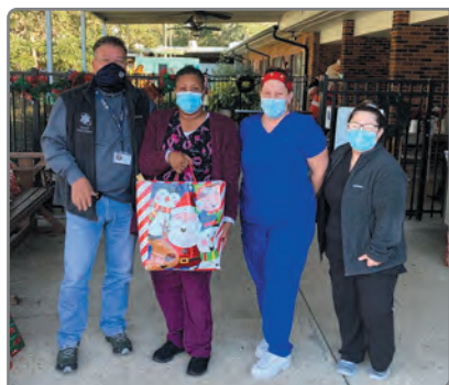
The Iberia Parish Sheriff's Office distributed holiday gifts for 250 local seniors living in area nursing homes.