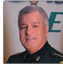
East Baton Rouge Parish Sheriff Sid Gautreaux Nights of Remembrance