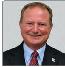
Assumption Parish Sheriff Leland Falcon Summer Camp