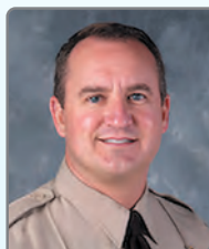
Webster Parish Sheriff Jason Parker Scholarship Program